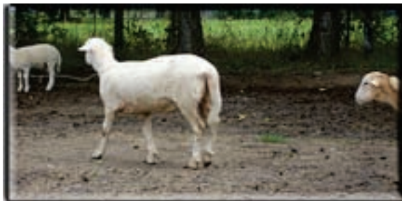
COR 05-02 RR (111 days old, 113 lbs.)

"If it's in the RAM, it will be in the LAMBS"