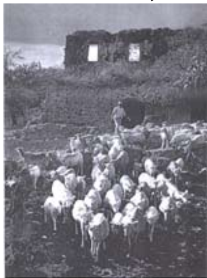
Goats Browse Contentedly Where Sugar Barons Once Held Sway