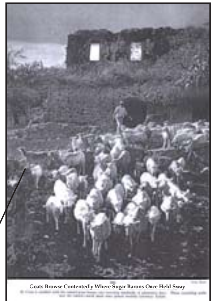
National Geographic, February 1956, Page 216

Do you need a useful gift to provide to your breeding stock buyers? This is a gift to hand to buyers or to mail to them prior to lambing to remind them of your flock. The farm flock books have a space on the inside cover to put your contact information. We suggest that you print a small label or have one printed that you can paste into the book. To make handling and shipping efficient, they will be available at $5 for four books. Send your request to Barbara Pugh, 5332 N. C. 87 North, Pittsboro, NC 27312. Payment made to KHSI should be included.